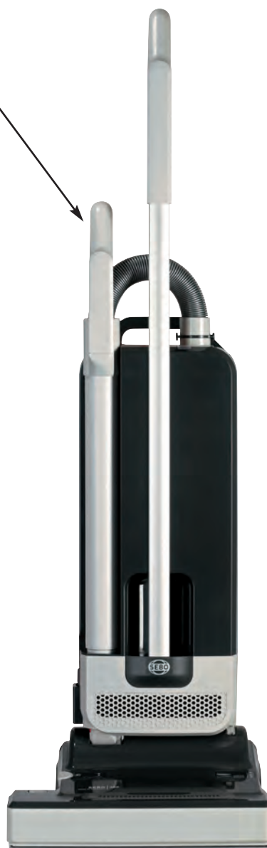
350 MECHANICAL Dark Gray #91313FC