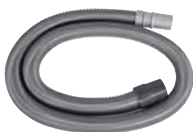
9-Foot Extension Hose* #1495FC

An optional nine-foot extension hose is available, which creates a total hose length of 15 feet, perfect for cleaning stairs. Choose from a range of optional attachments that can be fitted to the wand or hose!