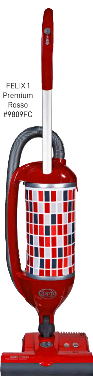
FELIX 1 Premium Rosso #9809FC

Amazingly, the FELIX can even morph into a hard-floor polisher by attaching SEBO's DISCO head.