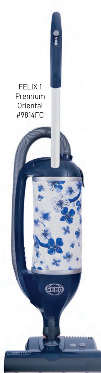
FELIX 1 Premium Oriental #9814FC