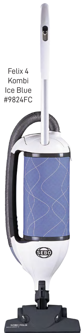
Felix 4 Kombi Ice Blue #9824FC