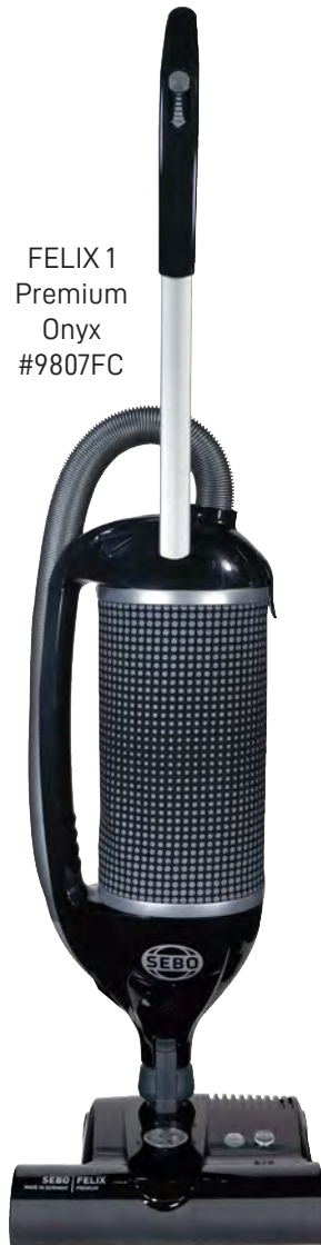
FELIX 1 Premium Onyx #9807FC