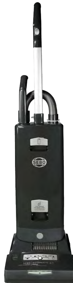
AUTOMATIC X7 Premium Graphite #91543FC