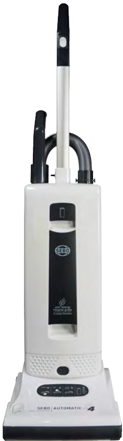
AUTOMATIC X4 White #9570FC