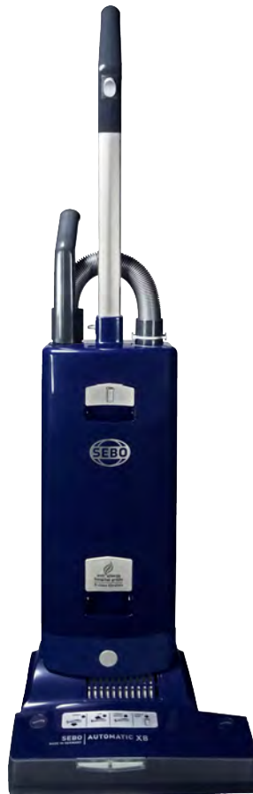
AUTOMATIC X8 Blue #91566FC