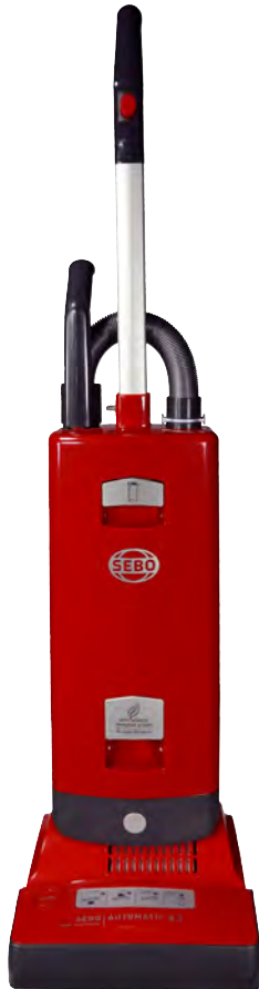
AUTOMATIC X7 Red #91503FC