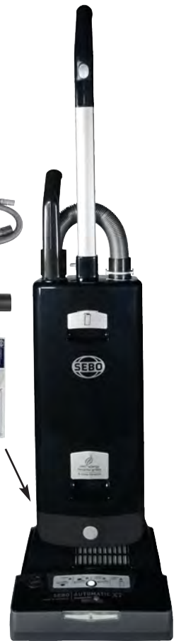
AUTOMATIC X7 Premium PET Black #91540FC

A low, 6-inch, flat-to-the-floor profile makes cleaning under furniture easy!