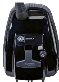
AIRBELT K3 Premium Black with ET-1 and Parquet Brush #9688FC

The handle includes a slider switch that provides convenient suction control, for normal to more delicate cleaning tasks.