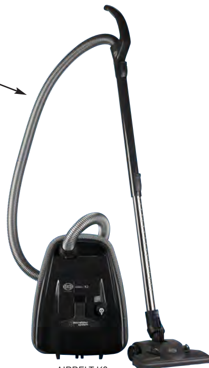
AIRBELT K2 Turbo Onyx #9695FC