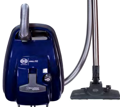
AIRBELT K2 Kombi Dark Blue #9679FC

Because the K2 models have hoses and telescopic tubes without power cords, their suction adjustment switches are located on the canister body, not the handle.