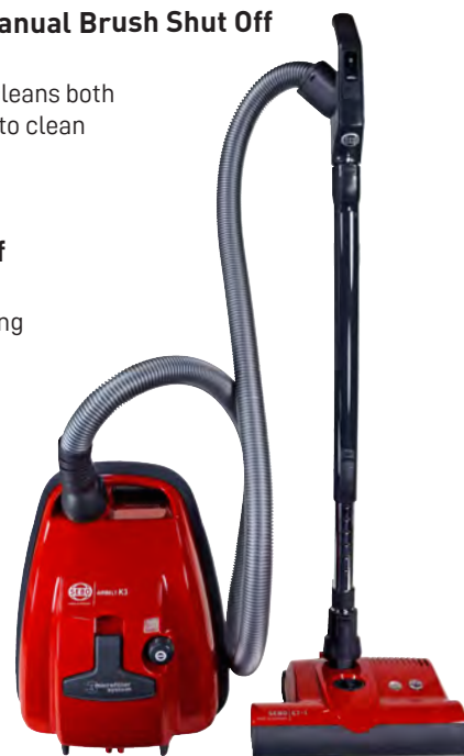
AIRBELT K3 Premium Red with ET-1 and Parquet Brush #9687FC